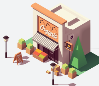
Fruit & Vegetables