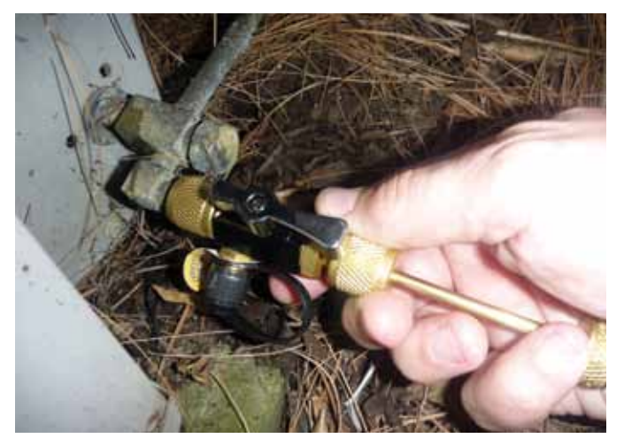
Valve cores should be removed with a vacuum-rated core tool to allow nitrogen to be purged through the system and allow the system to be valved off during tubing installation.

Start with fresh, dry vacuum-pump oil. Vacuum-pump oil is extremely hygroscopic (moisture absorbing) so starting