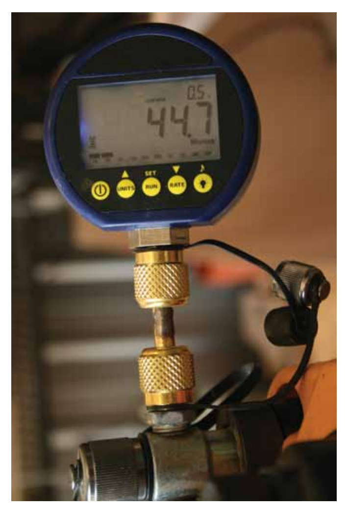
☆ A pump that will not achieve below 100 microns is in need of service; a good pump will achieve 20 microns or less.

Increasing the system pressure will actually cause the water to drop out of the nitrogen similar to that of compressed air in an air compressor. Nitrogen does not absorb water, but entrains it and helps it move along out of the system, allowing the liquid water to warm, evaporate and increase the water-vapor pressure without introducing additional moisture into the system. If the system is drying out, deeper levels of vacuum are quickly achieved indicating progress in the job of dehydration. If desired or required, repeat this process until the moisture is removed. Typically no more than a triple evacuation with sweep should be required. If marked progress is not achieved during this process, repeat the nitrogen purge to remove liquid moisture that may exist. If a leak is indicated, it must be repaired before the evacuation can be completed.