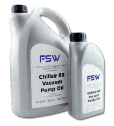
See Section Q For vacuum pumps and accessories