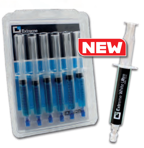
NEW Extreme White Ultra is suitable for R600 & R290 refrigerants.